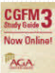
2013 Edition of CGFM Study Guide 3